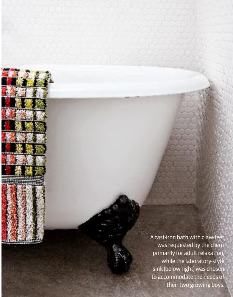
A cast-iron bath with claw-feet was requested by the client primarily for adult relaxation, while the laboratory-style sink (below right) was chosen to accommodate the needs of their two growing boys.